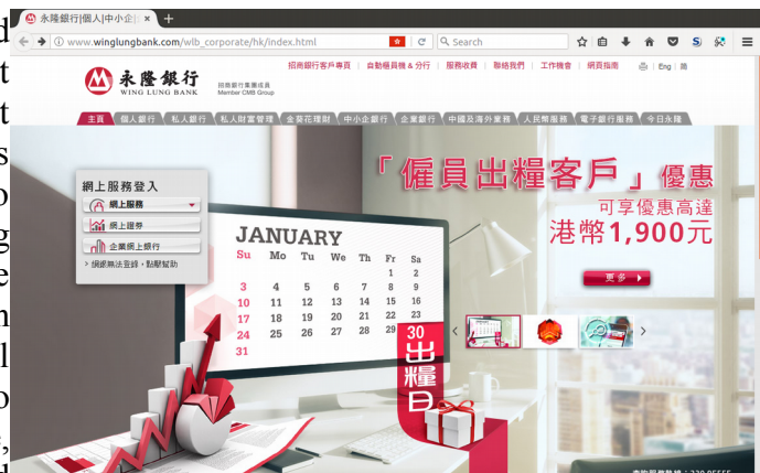
Real Wing Lung Bank website, by default unencrypted.

The differences between the real and fake sites are striking, the fake does not copy the logo, colour scheme or layout of the real site at all. It also uses English, while the real site defaults to Chinese. But the most surprising difference is that the fake site forces the use of an encrypted, https, connection using a valid certificate, but the real www.winglungbank.com site defaults to an unencrypted connection. Therefore, the fake site gets a reassuring closed green padlock in the address bar, and the real site does not. Admittedly, the real login page is https protected, but it is linked via a JavaScript button from the unencrypted front page. Should a bank expect their customers to run a script from an unidentified website to reach their login page?